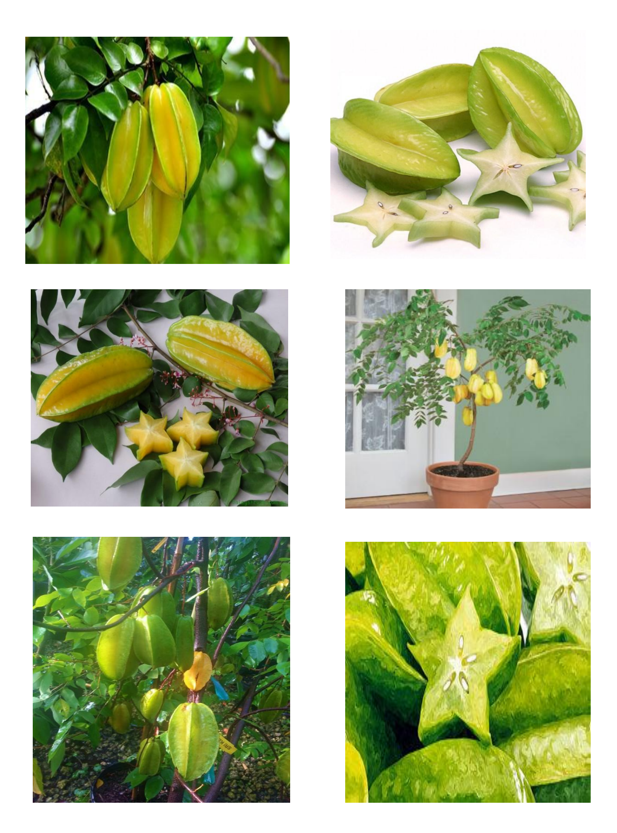
Plate 1. Habit and Fruits of Averrhoa carambola.